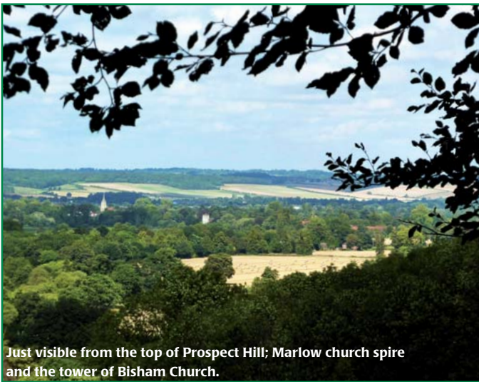
Just visible from the top of Prospect Hill; Marlow church spire and the tower of Bisham Church.