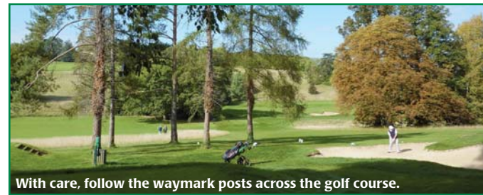
With care, follow the waymark posts across the golf course.