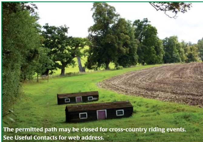
The permitted path may be closed for cross-country riding events. See Useful Contacts for web address.