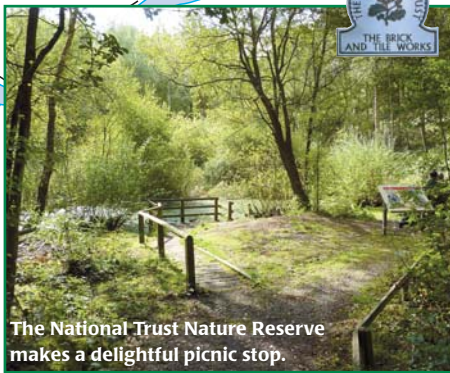
The National Trust Nature Reserve makes a delightful picnic stop.