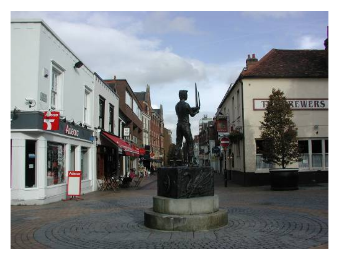
The statue at the west end of the High Street

This statue, located at the top of the High Street was badly vandalised over the August Bank Holiday weekend in 2003. The boat was broken off, as was the left arm that is still missing and the statue itself was wrenched off from the plinth leaving only its feet behind.