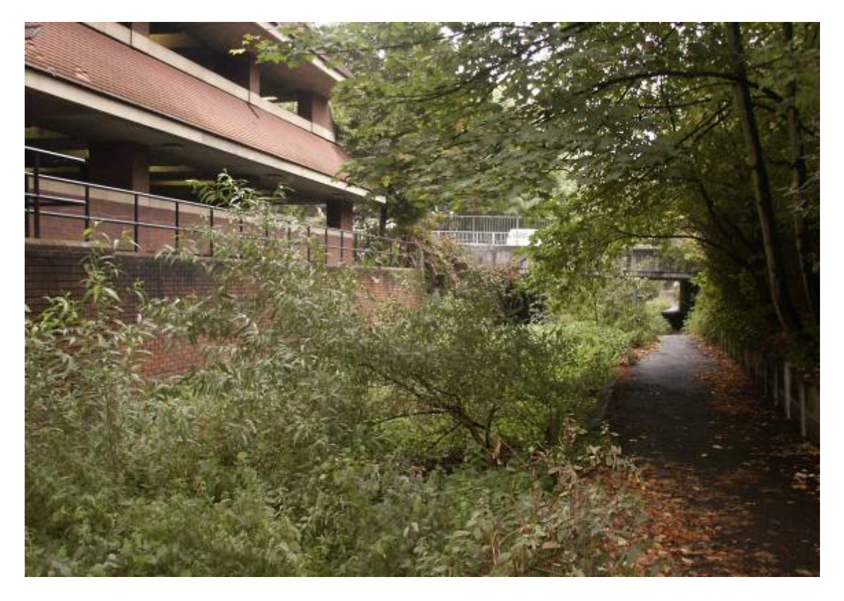
The same view today

We have also asked when the "long term" re-design of the Marsh Meadow ditch he mentioned last year is likely to happen. At present their only plan is dredge the White Brook nearer to the Thames next year. Any further details will be presented at the AGM.