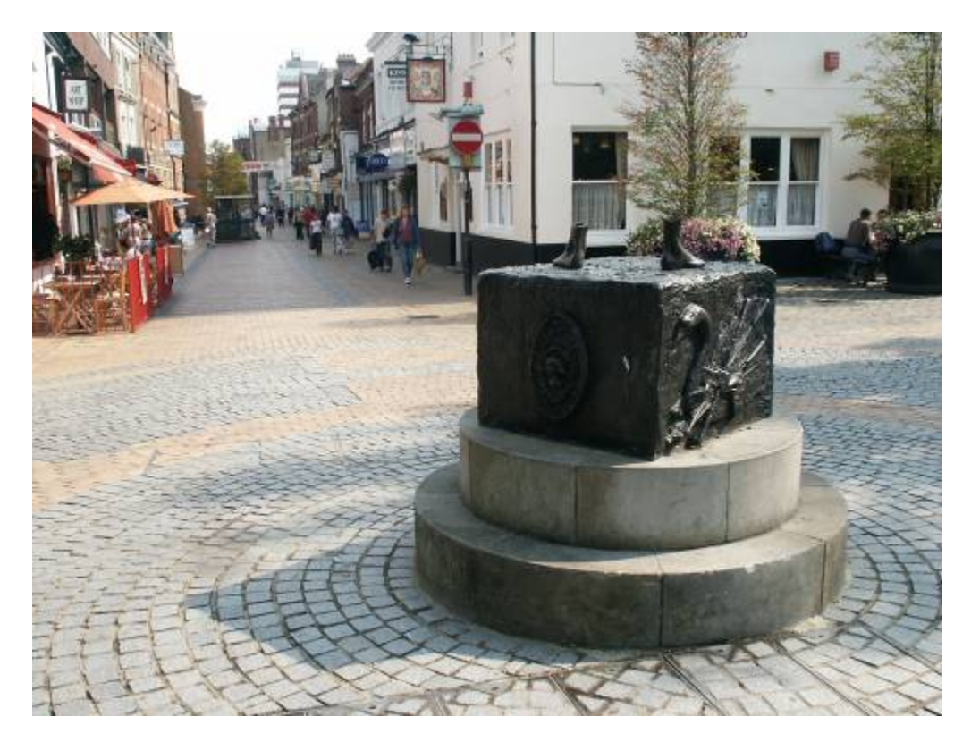
Two feet - all that currently remains