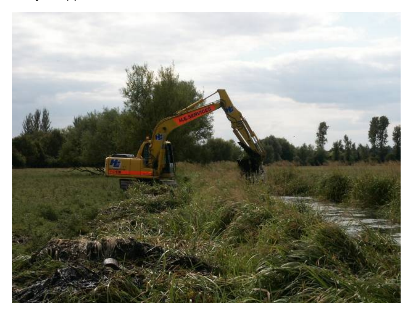
Digging out the White brook on Widbrook Common

Unfortunately the absence of water from the town centre has been more marked this year despite last winter's floods. Water dropped at the beginning of April and is still absent now (12 Oct) except for storm drainage - this despite the dredging of the White Brook on Widbrook Common and a small amount of reed removal from the Marsh Meadow ditch, carried out by the Environment Agency at the end of August/beginning of September. Once a channel had been cut in the reeds on the White Brook, flow did commence from the Thames (this can be regarded as the normal direction of flow) but as of 12 Oct has only got to the loop in the stream west of Strandwater where it is impeded by yet more reeds.