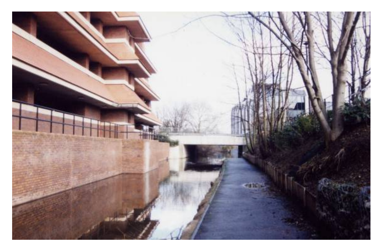
York Stream in the Town centre, shortly after the improvements in the 1990s