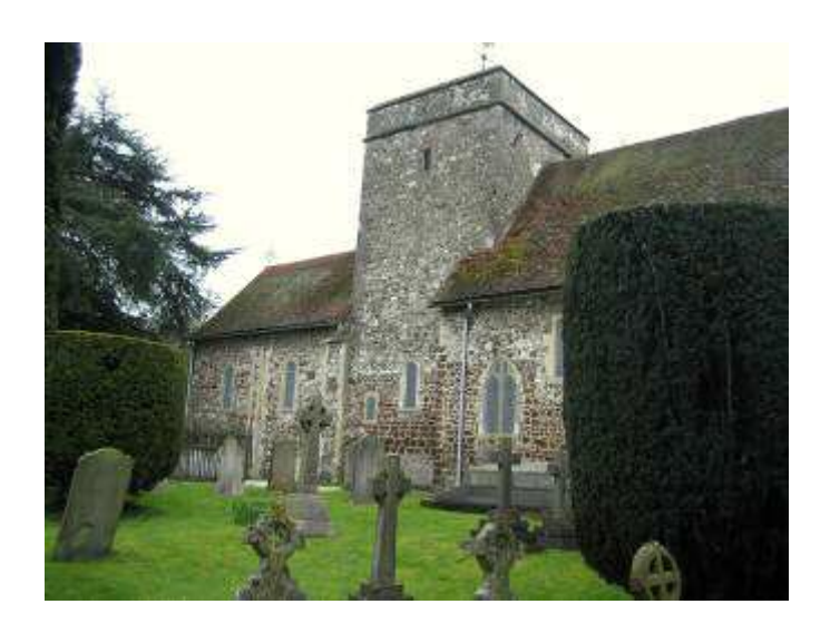
St Laurence's Church, Upton – Slough's oldest building

Upton Court is the second oldest building in Slough. Tree ring dating of the present building gives a construction date of ca. 1325. It has the standard medieval pattern of an open hall and a cross wing. It preserves the original central hearth, underneath the present floor on which an open fire provided heat for the hall. Dormer windows were included to let smoke out of the room. A new annexe was added in 1988 and until recently it was the home of the Slough & Windsor Observer newspaper group. The Court is currently empty and we have the opportunity to see inside before it is relet.