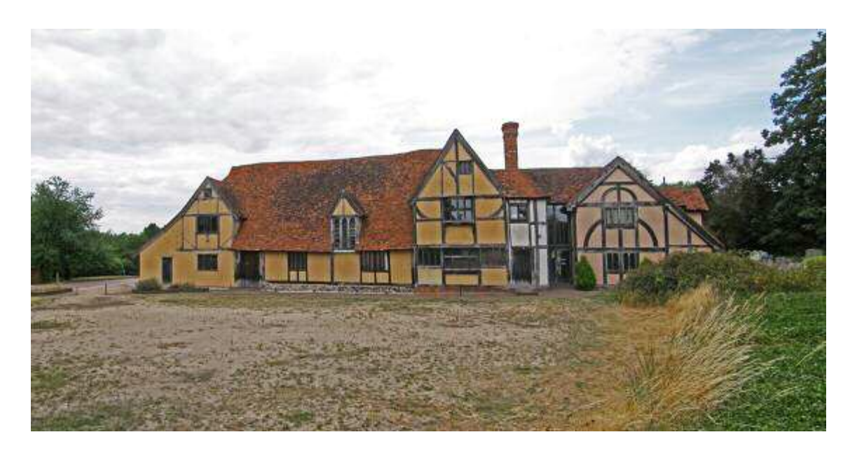
Upton Court – a 14<sup>th</sup> century building with a 20<sup>th</sup> century annexe

Upton Court is the second oldest building in Slough. Tree ring dating of the present building gives a construction date of ca. 1325. It has the standard medieval pattern of an open hall and a cross wing. It preserves the original central hearth, underneath the present floor on which an open fire provided heat for the hall. Dormer windows were included to let smoke out of the room. A new annexe was added in 1988 and until recently it was the home of the Slough & Windsor Observer newspaper group. The Court is currently empty and we have the opportunity to see inside before it is relet.