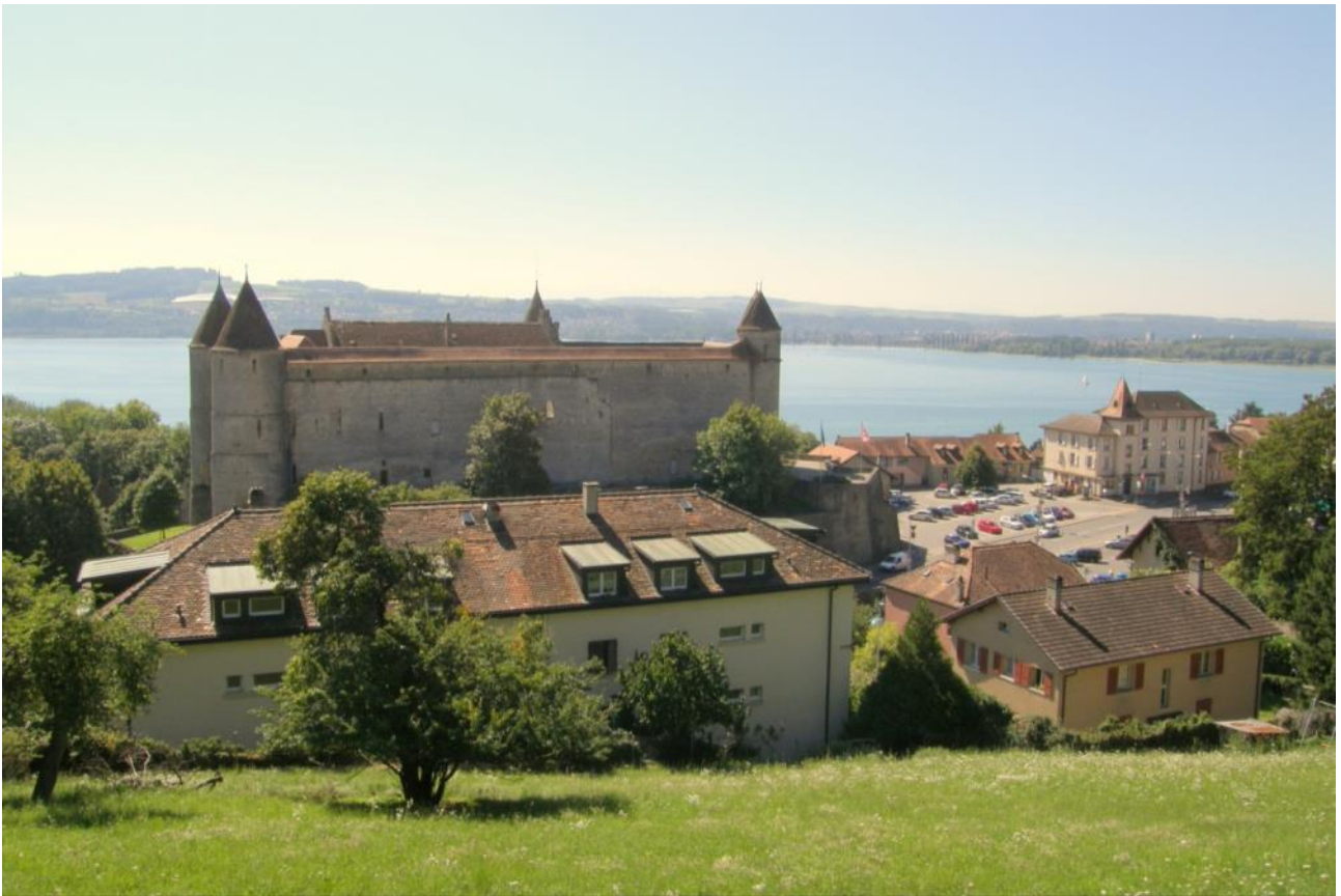
Chateau Grandson in Vaud, Switzerland - rebuilt by Otho Grandison ca. 1377

The following photos demonstrate just some of the places associated with the Grandison family. Their built legacy extends over Switzerland, England, Wales and Ireland.