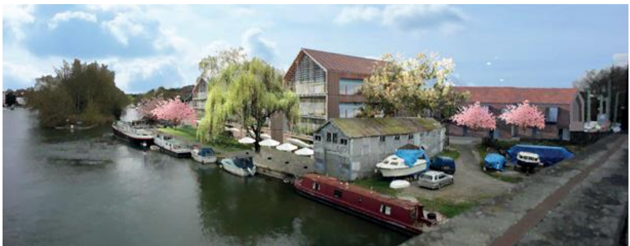
A restaurant and apartments are proposed for the Skindles site