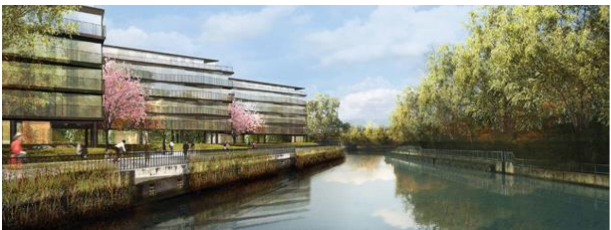
Artist's impression of apartments on former mill land alongside the Jubilee River

Of course, there has also been consultation on the outline proposals for Mill Lane, Taplow and the redevelopment of Taplow Paper Mill and Skindles. You will be aware that there is considerable disappointment at the lack of vision indicated by Berkeley Homes. The majority of new dwellings front the Jubilee River, and the height and scale of the three proposed apartment blocks are a cause for concern.