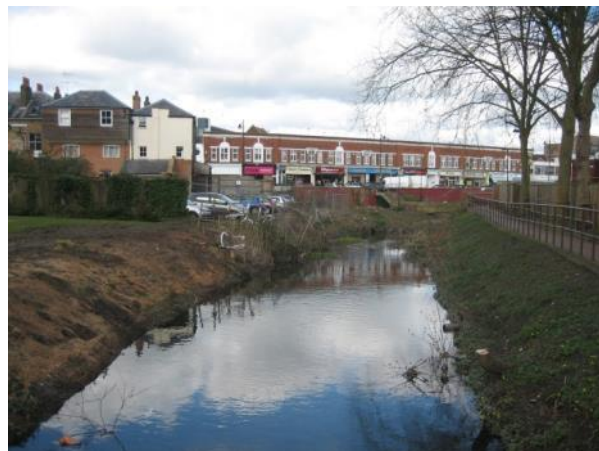
Views of Chapel Arches before (Feb 2014) and after (Mar 2014) tree removal