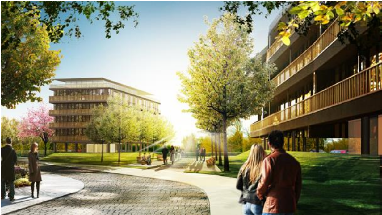
Another view of the proposals for the “Millside” apartments

New development facing the Thames is limited, but Skindles would become a combination of restaurant and residential apartments. The concept of a hotel remaining on the site appears to have been intentionally omitted. Even a “restaurant with rooms” would be a more enhanced leisure facility. In fact there is a distinct lack of attention to the leisure potential of the site – no marina or other water related activities. There is also a lack of access to the river bank, although we are encouraged that there appears to be an ongoing commitment to the concept of a footbridge link to the Ray Mill Island on the Maidenhead bank. As might be expected the current proposals are very residentially orientated.