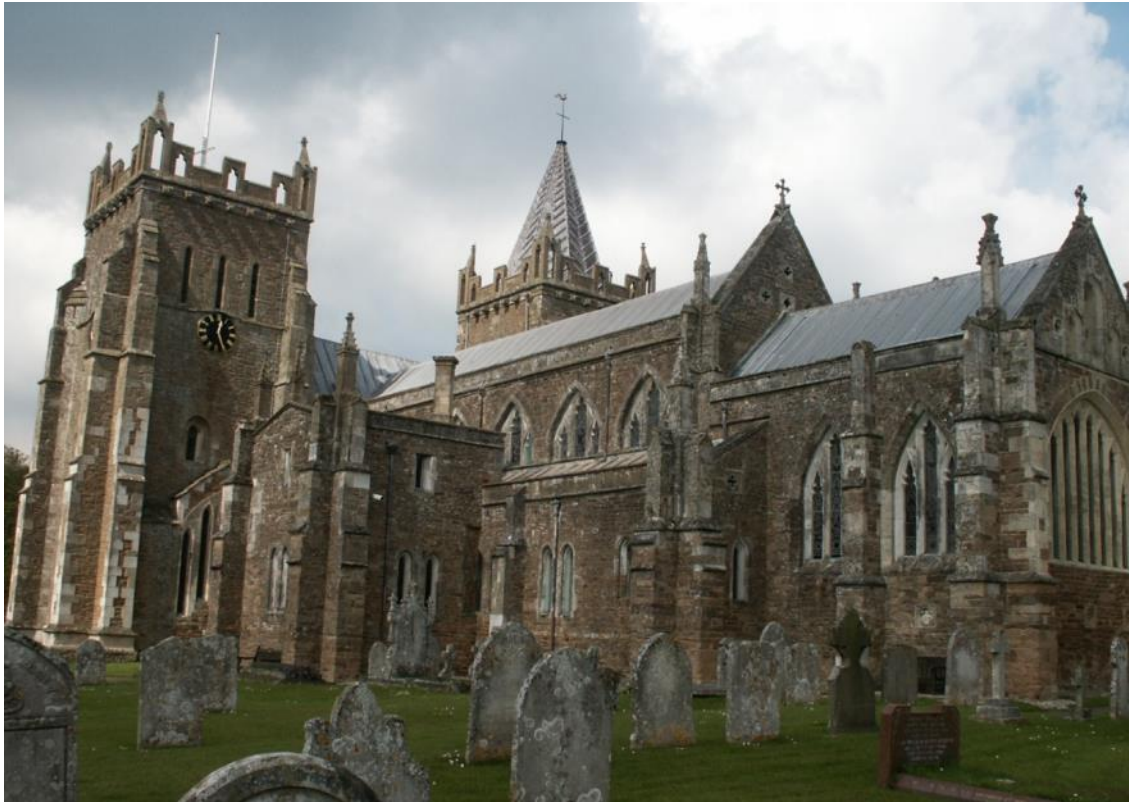
Ottery St Mary Church, Devon, built by Bishop John Grandison as a miniature replica of Exeter Cathedral