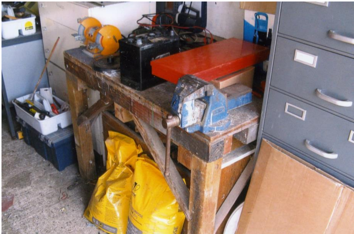
The “recycled” work-bench still in use in March 2014