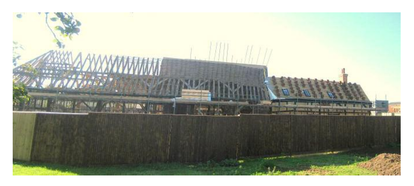
The medieval barn during restoration- we were told that the two sections are of differing medieval dates......

The Farm is located to the east of Widbrook Common, as you approach Cookham. For the last six years, with permission of the Edwards family who farm there, walkers participating in Maidenhead Rotary Club's Boundary Walk have been able to walk along its southern boundary to reach the Thames Path, a missing link in the Society's Millennium Walk project. White Place Farm, because of its long history, is also home to a complex of buildings that are Grade II listed and some of these have been re-developed for housing.