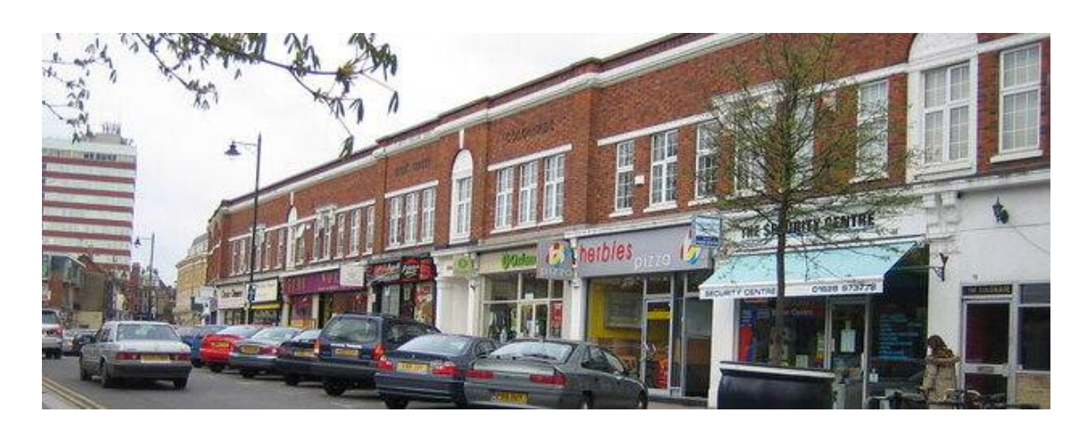
The Colonnade – time to go?

In general terms, the visual setting of the waterway is maximised by the scheme - with a Venetian feel being achieved. We are concerned that along the banks there should be maximum pedestrian access, and that boat users are able to get onto the footpath in an emergency. The model appears to show sections of sheer wall facing the water. The introduction of numerous small specialist retail units and a variety of eating / drinking venues will create a daytime and evening leisure culture.