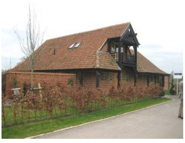
The renovated dairy building