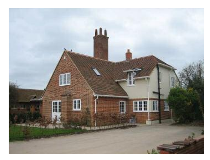
The Pump House today

Both these buildings have now been redeveloped as houses, as has the former pump house that apparently pumped water under the Thames and up to Cliveden, in addition to providing the power for the first electrical milking of cows in Berkshire.