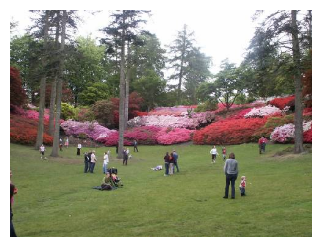
The "Punchbowl" at Valley Gardens