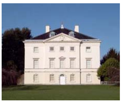
Marble Hill House

In the afternoon we are going on a guided tour of the BBC Television Centre in Shepherds Bush. Numbers are restricted, so book early.