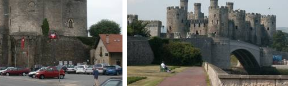
Grandson Castle, Switzerland