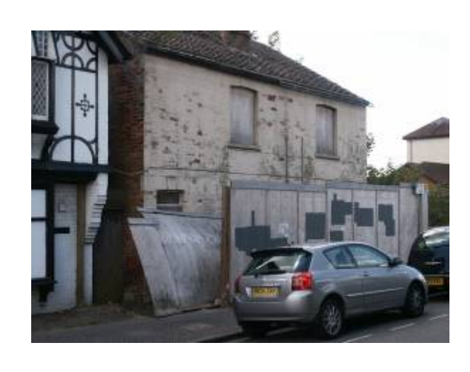
Open-air art gallery at the corner of Waldeck Road