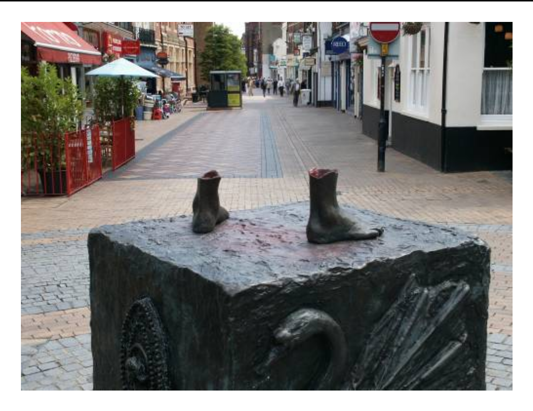
Legless in Maidenhead! (See inside, page 6)