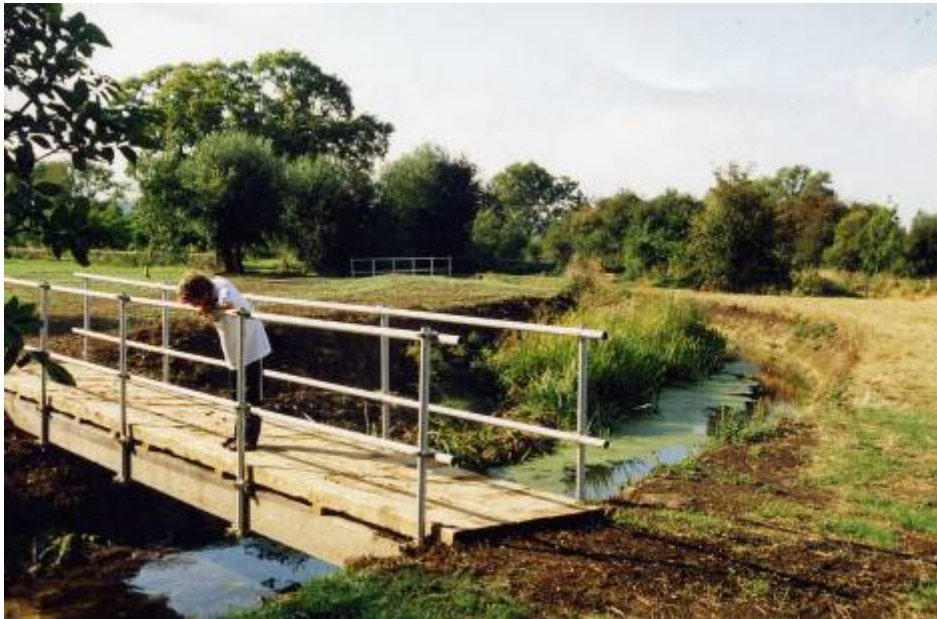
Newly diverted Maidenhead Ditch near to the cricket club, September 1998

Two photos from the report demonstrate the problem. One shows a part of Maidenhead Ditch that had been recently diverted in 1998 to give room for an extra pitch in the cricket club. The other shows the same section of stream seven years later. This clearly shows the amount of reeds and watercress that had accumulated in the stream over that period. Since the entire ditch has this level of congestion it is hardly surprising that water has difficulty flowing through it.