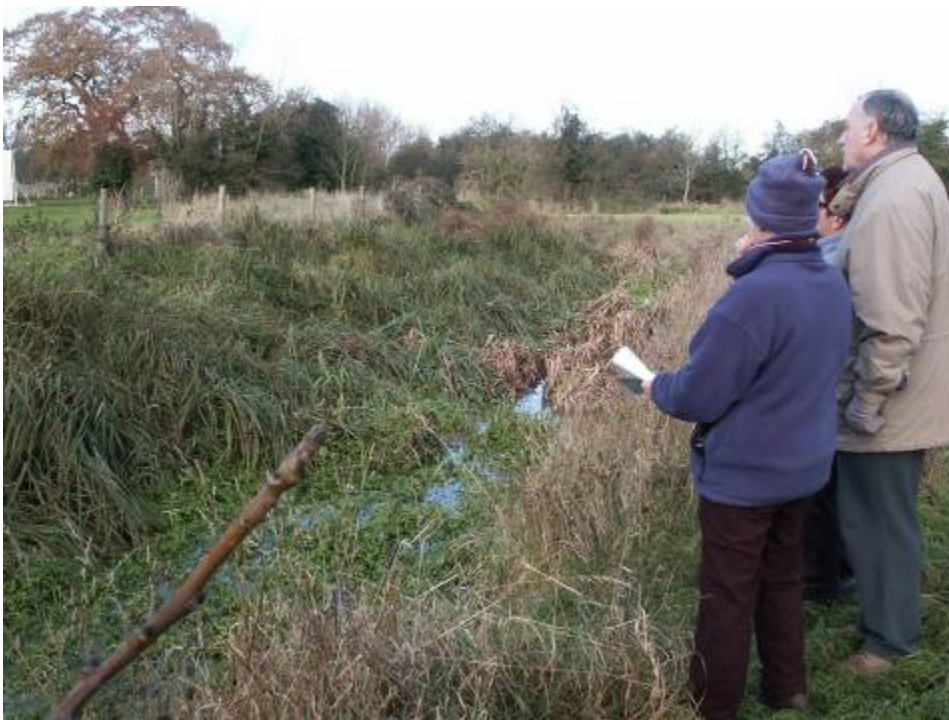
Same section of Maidenhead Ditch, November 2005

The Environment Agency has blamed dry winters, low groundwater tables, and low flow in the Thames for the problem of lack of flow in York Stream. The past history of this stream shows that obstruction by vegetative growth and silt is a major problem and only regular clearance can keep the stream flowing.