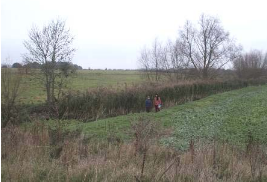
Reeds clogging Maidenhead Ditch, north of the flood control gate, November 2005

There is now water in the town centre stream but how long it will stay there is anyone's guess; probably by June it will retreat. The Environment Agency (EA) did more dredging of the White Brook last year, which will help, but haven't touched Maidenhead Ditch which is completely clogged with reeds.