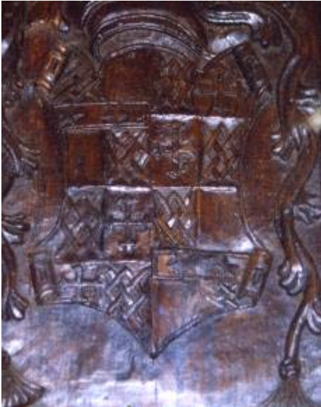
Edward Norris (d. 1606) coat on bench-end at Childwall Church

will see the quarters are transposed on the bench-end and this follows the description of the coat in the 1567 Visitation. The coat on the Westminster Abbey armorial and at Speke Hall has the usual Norris of Speke coat.