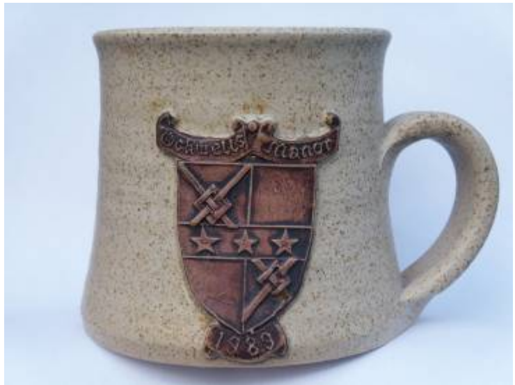
Ockwells Cup with Norris of Speke coat - a historian's nightmare

The coat with transposed quarters has obviously got into some armorial catalogue so that when the Ockwells Cup was commissioned by the Cox Green Community Association in 1989 not only was the Speke rather than the Ravenscroft for Norris coat used but it was the incorrect version and with an extra molet. This will confuse some poor historian in the future!