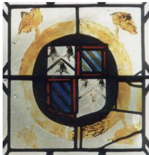
Norris (Ravenscroft quartering Merbrooke) of Ockwells