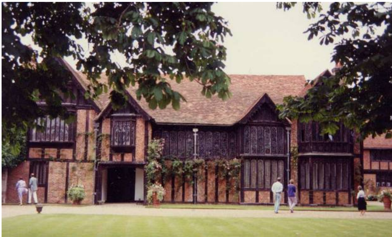
Ockwells Manor, Maidenhead

The Society for the Protection of Ancient Buildings (SPAB) in one of their earliest campaigns helped preserve Ockwells Manor house. In 1880 they produced a report detailing its state and condition and by 1887 there were fears that the house would be destroyed, with William Morris himself declaring in the press that it must not be. Then owned by William Henry Grenfell, Lord Desborough, the house was subsequently restored. The Civic Society, as part of a special edition on stained glass of their magazine Cornerstone , arranged to photograph the Ockwells glass and I was asked to write about it. The magazine also includes an interesting article on the shortcomings of said restoration and the SPAB's involvement. I have deposited copies of Cornerstone (vol 25, no 4, 2004) in the Heritage Centre and the library should you wish to see it.