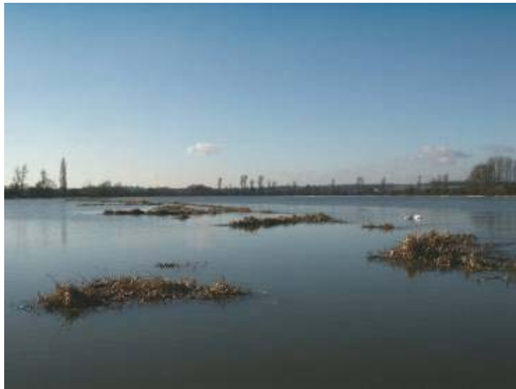
The White Brook in full flood – see article on page 9