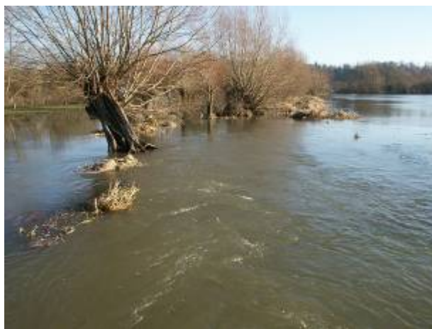
The White Brook east of the Lower Cookham Road on 9 January 2003 in flood conditions flowing towards the Thames

Michael Bayley also often describes what York Stream used to look like. The photographs (over the page) of York Stream to the north of Maidenhead taken in 1950/51 by Mr T. C. Fields, then residing in Ellington Park, illustrate the change. The photos are from approximately the same