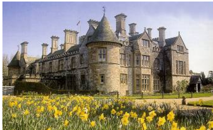
Beaulieu Palace House

Our next outing is to the Beaulieu Estate in Hampshire on Saturday 22 nd March. This is the home of the National Motor Museum, which stands in the grounds of the Palace House, Abbey and beautiful Gardens. We will be visiting the Abbey, which dates from 1204, as well as the Palace, which was originally the Great Gatehouse of the Abbey.