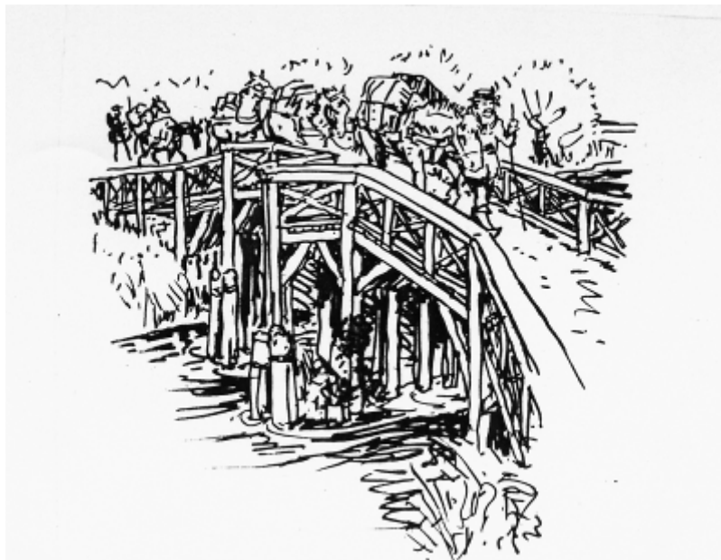
Sawkins Bridge, Bray, in medieval times.

The footpath from Bray Village to the Fishery passes over a grassy ditch by way of a concrete and rusty iron bridge called Sawkins Bridge. This is where the York Stream and Greenway Ditch rejoin the Thames. 70 years ago it could take canoes and punts, and 200 years ago, barges. It is another very old local place name – “SAWGH-KENS Bridge” means “the former backload or horseload bridge”.