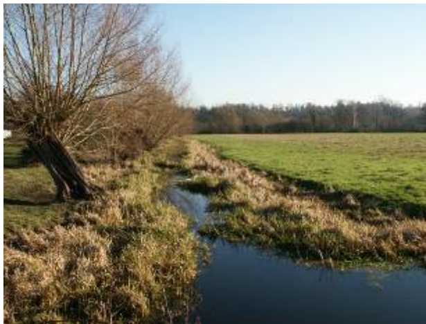
The White Brook east of the Lower Cookham Road on 18 December 2002, showing the reed growth and flowing from the Thames

If we are lucky, this flow may scour out some of the silt and reduce the need for dredging. However, it's probable that despite the present abundant water, if nothing is done to improve flow, the stream is likely to dry out again next summer. We will continue to press the Environment Agency to produce a long-term plan for managing the stream which will ensure year round water in the town centre.