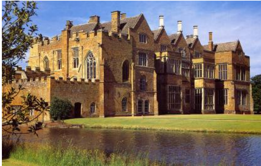
North Front, Broughton Castle, Banbury, Oxfordshire