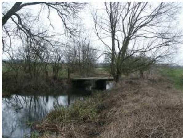
Approx. same location in December 2002