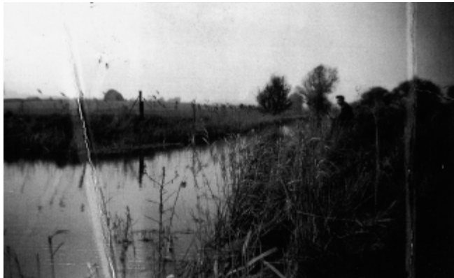
York Stream east of Halfway Houses in 1950/51

location to the east of Halfway Houses, in 1950/51 and today. Fifty years ago the stream appears wider and far less overgrown than at present.