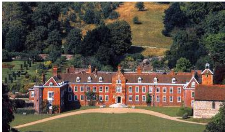
Stonor, Nr Henley on Thames