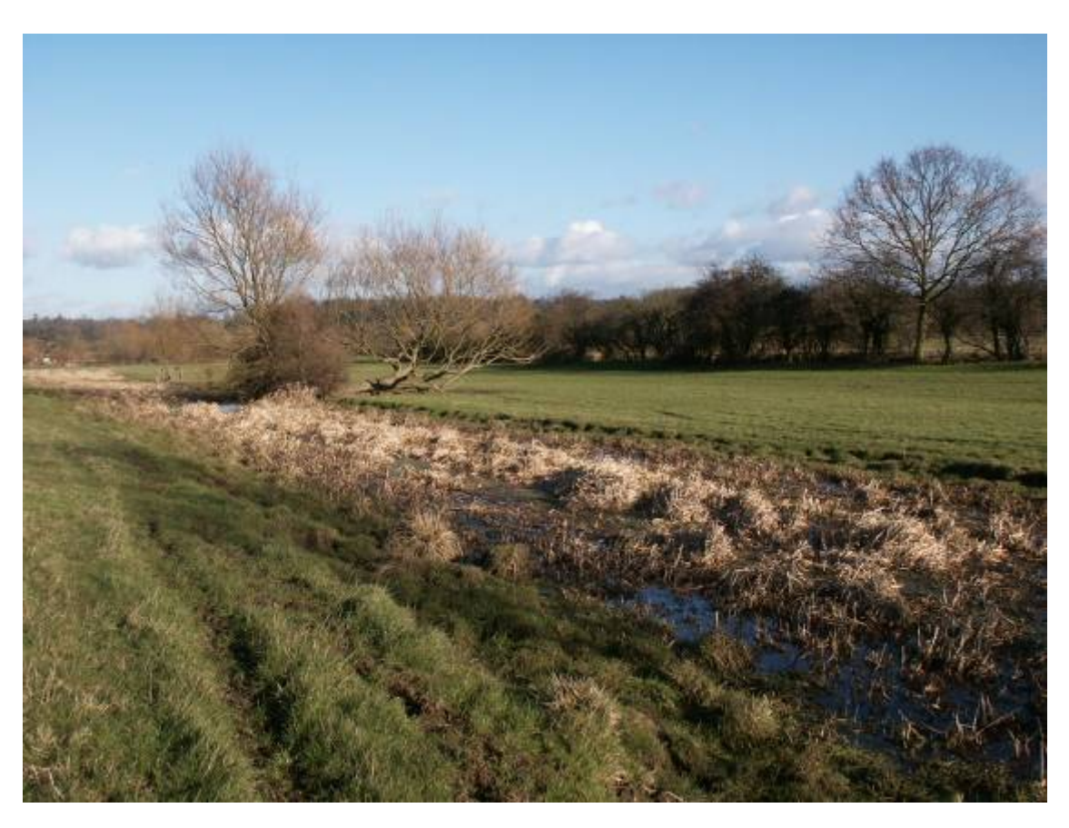
Reeds clogging the White Brook on Widbrook Common

We have been monitoring the situation at Islet Park and can report that following the floods in January (see Jan 2003 newsletter) water was still moving into the Thames on 5 February. Since then flow has gradually decreased with no flow being recorded during the latter half of March and early April. Until the Environment Agency clears some of the accumulated reed we think it's unlikely that flow from the Thames at Islet Park will recommence. Without this flow the town centre is likely to dry out again.