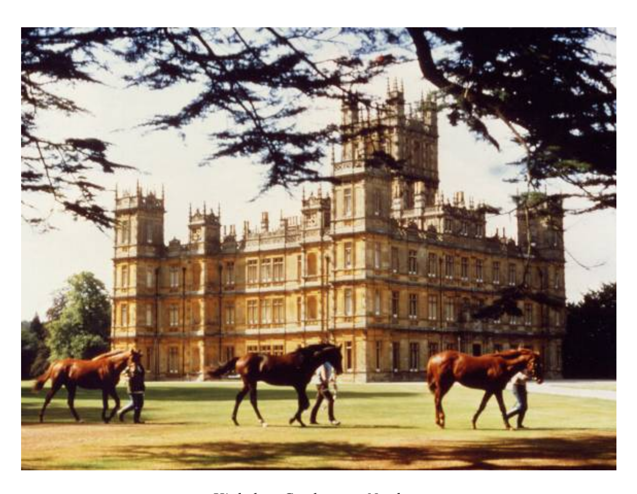
Highclere Castle, near Newbury

On the 6<sup>th</sup> July we are visiting Highclere Castle, just outside Newbury and Broadlands on the edge of the New Forest. Highclere is only open to the public a few weeks each year, so this will be a rare opportunity to see this Castle with its many styles and some of the treasures that the 5<sup>th</sup> Earl of Carnarvon found when discovering the tomb of Tutankhamun.